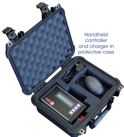
Handheld controller and charger in protective case